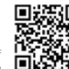
Watch our staff & safety video

We have 3 state-of-the-art clinics in Verbier, and both camps have access to a regional hospital and two University hospitals only 40 minutes and 75 minutes away respectively or just 10 minutes by helicopter.